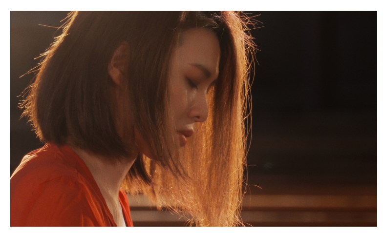
Live performance video shoot, London, UK. July, 2022 (Video available on YouTube and AppleMusic)

Throughout To Sail , crystalline sparkles can be heard in the right hand, like light bouncing off water. The piece ends as the waves return back to stillness.