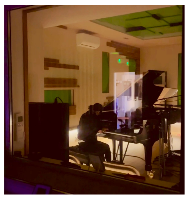
Recording at Masterchord, London, UK. April, 2022